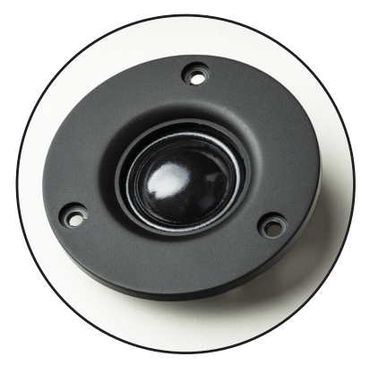
1" silk dome tweeter

For transparent and smooth treble response.