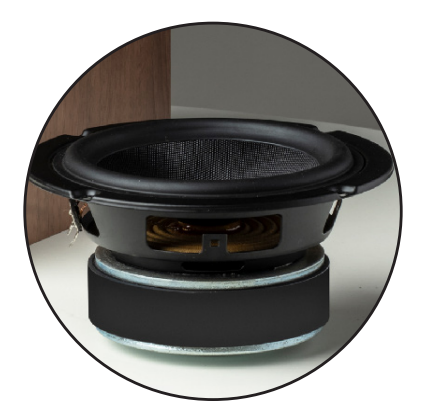
5" fiber glass bass/mid woofer

Extra dense acoustically optimized MDF. Allen screws fix the chassis mechanically perfect to the cabinet.