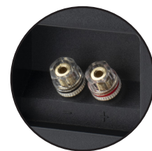
Gold plated terminals