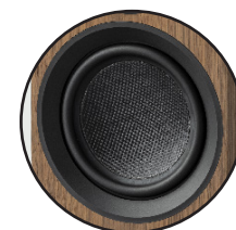
Fiber glass carbon composite woofer